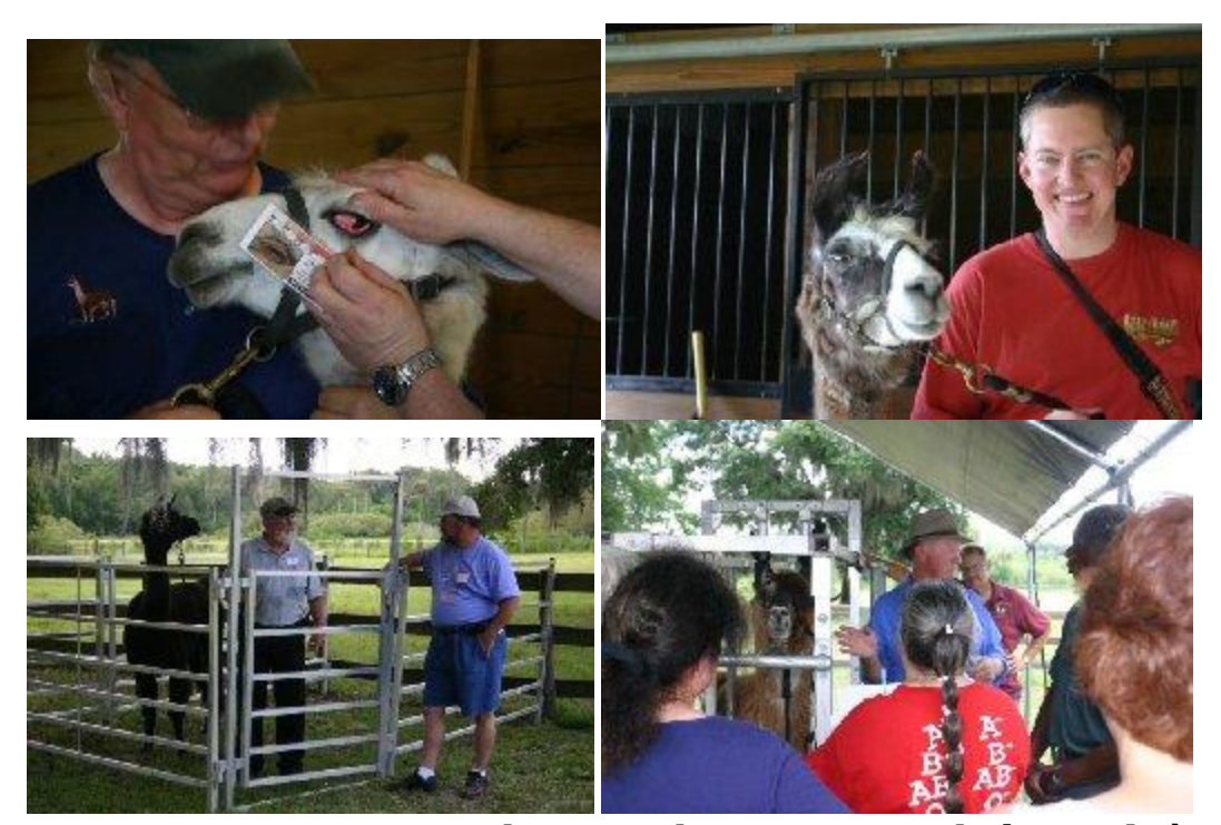
whoot whoot - good times! :)