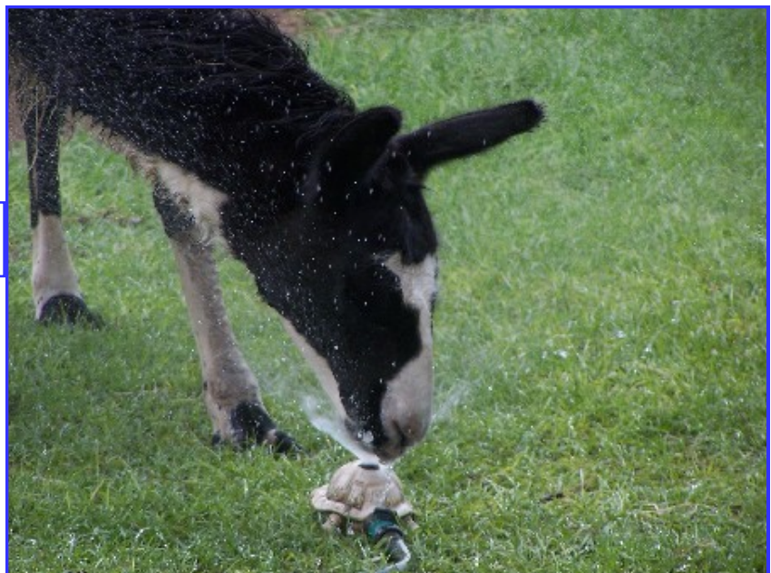
Magic keeping cool Turtle Run Llama Farm